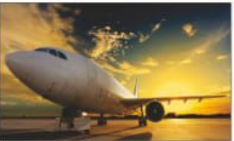
Airport - Lucknow