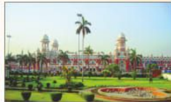
Charbagh Railway Station, Lucknow