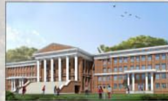
New Amity University