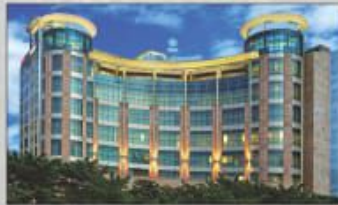
Tata Consultancy Services, Lucknow