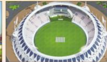
International Cricket Stadium, Lko.