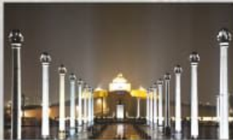
Ambedkar Park Lucknow

24x7 Security | Gated Community | Wide Roads STP Plant | Proposed Sewage System | Electricity & Street Light Solar System | Commercial Zone | Jogging Community Centre | Yoga Centre | Park